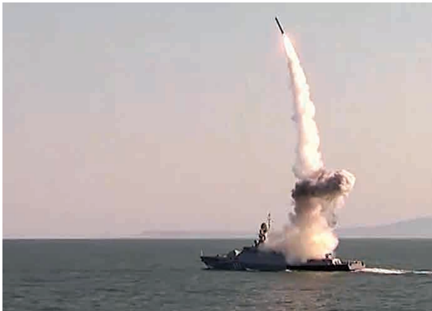
Cruise missile launch from Kalibr system.

On 5 February 2018, the first short range missile systems Iskander-M were delivered to the home base of the 152 nd Missile Brigade in Kaliningrad Oblast to replace the legacy systems Tochka-U. The new systems are capable to use both conventional and nuclear payload and can engage the ground targets within the distance of 500 km.