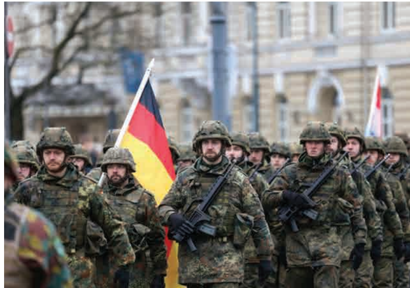
NATO eFP troops.

Russia's Armed Forces (AF) daily activities and exercises indicate that it took into account the increased NATO military capabilities in the Baltic region. Nevertheless, there are no indications that it would make a direct impact on the essential decisions of Russian political and military leadership. The development of Russian AF in the region is a continued implementation of plans that were made yet before 2014 (i.e. before Russia's aggression in Ukraine caused crisis in relations with the West). These plans and their implementation are being modified by Russian economic possibilities and lessons learned during the AF reform, however they are not directly related to NATO eFP deployment or other actions of the Alliance.