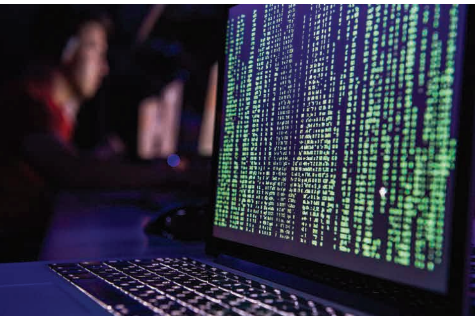
Cyber attack.

In 2017, APT28/Sofacy group infected and took control over the computer network of the international hotel chain with more than 5,200 hotels worldwide and gained access to their wi-fi networks. The group probably had access to all information (documents, correspondence, browsing history) sent and received by users on hotels' wi-fi network.