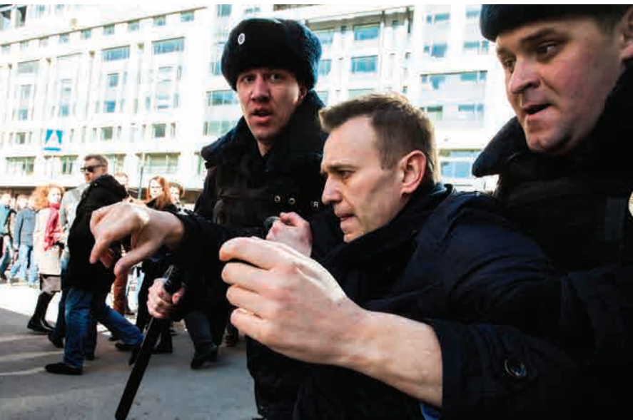
Aleksey Navalny arrest during anti-corruption protests in 2017.

their organizers were under pressure and got persecuted by law enforcement agencies. A surge of anticorruption protests that swept Russian cities and towns in 2017 revealed that the country's youth is not that politically passive as the older generation and it is prone to demand systemic changes in the state's political life. The younger generation does not subscribe to Putin's statements that political stability is the value in its own right. After all, a possibility that the protests could impel the ruling regime to make any structural reforms is extremely low in the upcoming years.