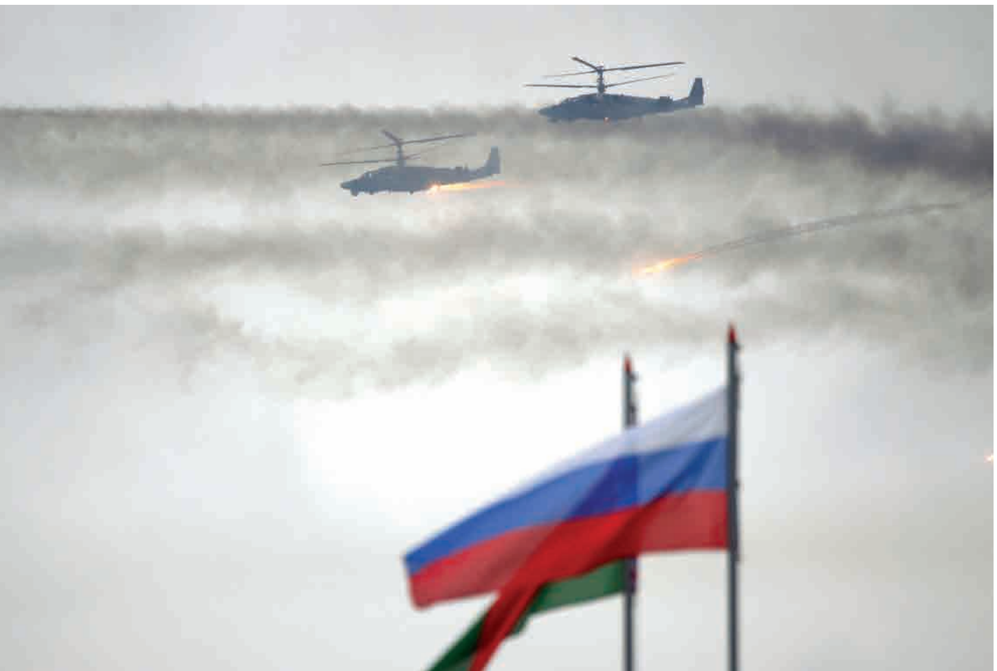
Russia – Belarus exercise Zapad-2017.

Russia presented to the states of the region false information about the prospective exercise geographical coverage, number of participants, and the scenario. The scale and complexity of the exercise show that it was not an antiterrorist exercise, but a check of operational plans