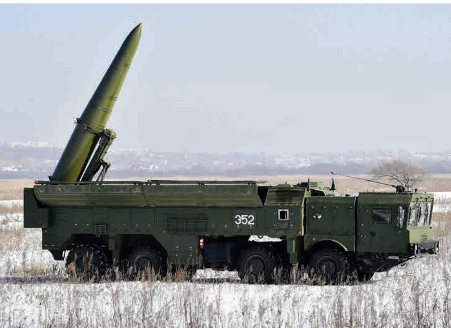
Missile system Iskander-M.

Russia's leadership had been occasionally threatening to deploy Iskander-M in Kaliningrad Oblast for a decade. In 2008, the then President Dmitriy Medvedev presented a potential deployment as a response to the establishment of US missile defence system elements in the Eastern Europe. Since then, the threats over deploying the system had been constantly issued as an 'asymmetric' response to US and NATO. Throughout this decade, Russia has rearmed with Iskander-M almost all missile brigades, and the 152nd brigade has become the 11th that was rearmed with the new missile systems. The Iskander-M deployment to Kaliningrad is a good example how Russia portrays elements of its armed forces' rearmament process as an alleged response to NATO.