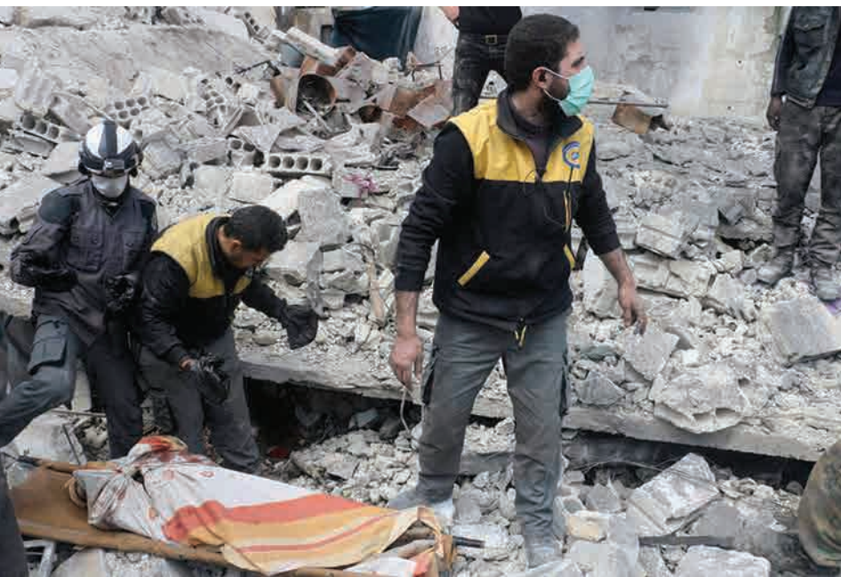
Search and rescue works in Eastern Ghouta, Damascus, Syria.

Accord remained incapable. New parliamentary and presidential elections will probably be held by the end of 2018, but they would unlikely