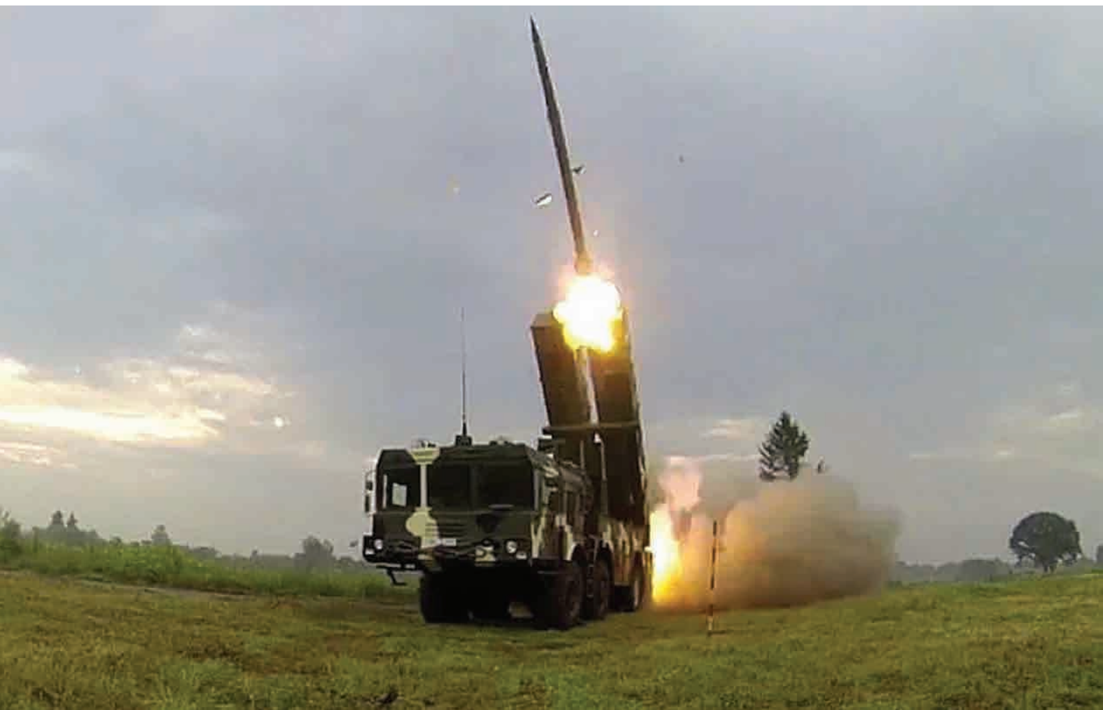
Multiple launch rocket system Polonez.