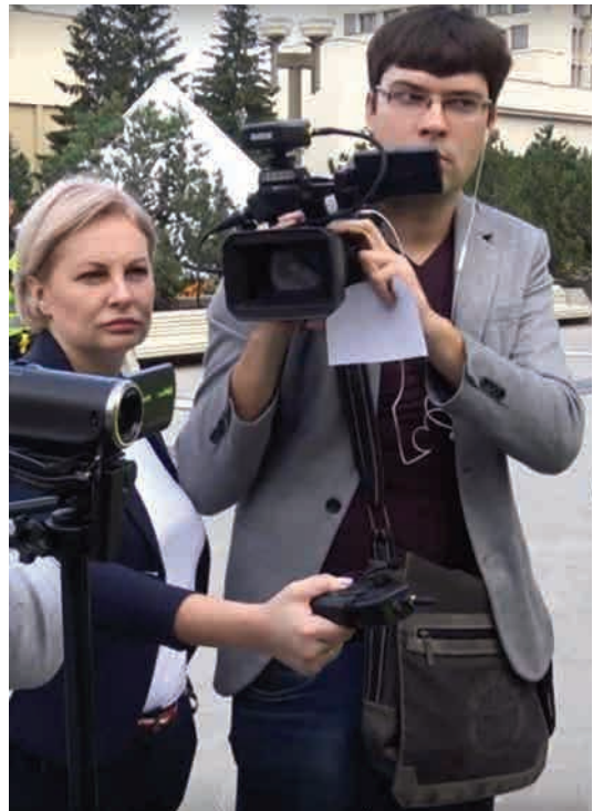
Russian propagandists arriving to conduct reports in Lithuania by concealing true reasons of their visits

As expected, during Zapad-2017 exercises the Baltic States and Poland were portrayed as the main countries spreading 'paranoia' in respect to Russia. This was to create a divide between the alleged 'Russophobic camp' and the 'moderate West'. However, the hostile communication line was of secondary importance. The main efforts of Russia's strategic communication were focused on the supposed transparency and openness seeking to improve relations with the West.