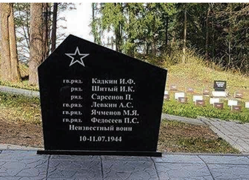
Illegally built monument.

In the recent years, in order to implement its historical policy in Lithuania Russia paid particular attention and allocated funds to projects preserving historical memory and Soviet heritage. Russia is particularly interested in reconstruction of the objects of military heritage, such as soldier graves and memorials, which are presented as a proof of Lithuania's inclusion in the Russian geopolitical space. In addition, such objects serve as places to rally supporters of Kremlin's policies.