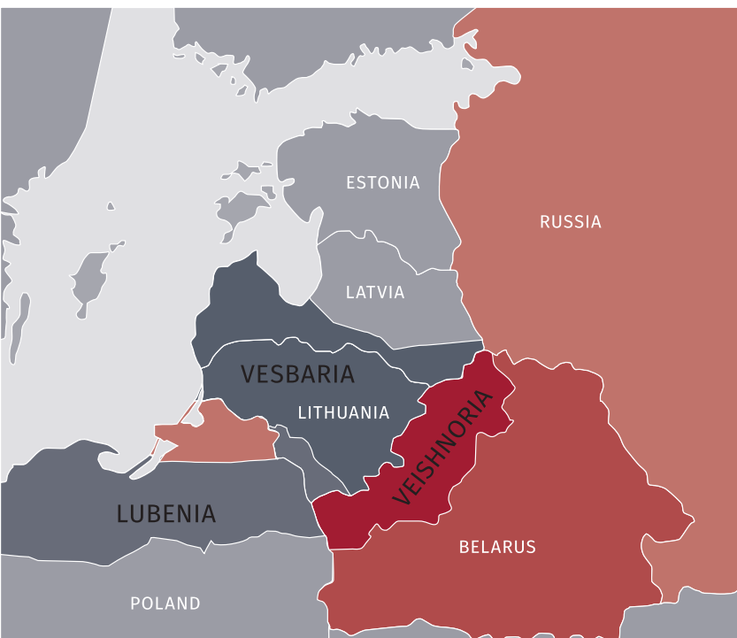
Element of Zapad-2017 scenario map

Although Minsk declares its neutral stance, the Zapad-2017 exercise once again proved that Belarus does not dissociate itself from Russian military planning in the Western direction. By demonstrating the ostensible frankness Belarus invited to the exercise international observers, journalists and highlighted that the main exercise episodes take place in its territory. By this, it was sought to conceal the real scale of the exercise in Russian territory. Moreover, through various persons associated with Belarusian authorities it was sought to infuse that there were two kinds of Zapad-2017 exercises: Russian aggressive and Belarusian transparent.