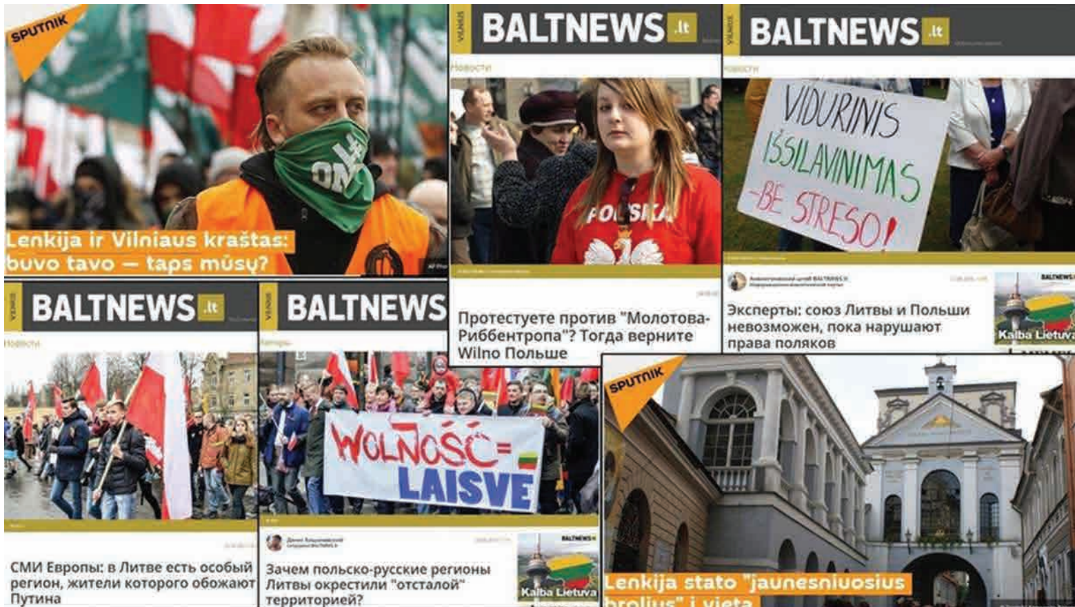
Russian propaganda media aims to damage Lithuanian – Polish relations