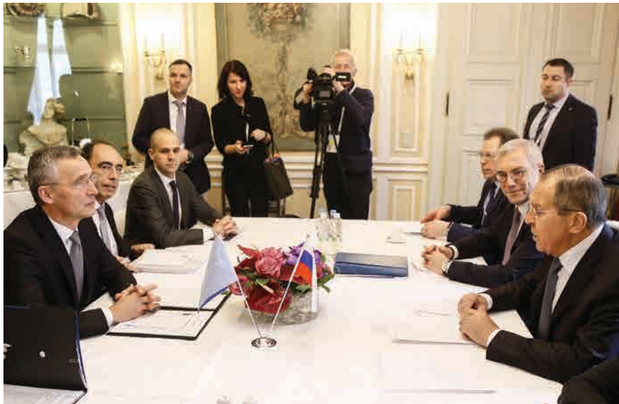
NATO – Russia delegations meet during Munich Security Conference in 2018.

In 2017, Russia tried to bring some positive dynamics into relations with the West and European states, and its political leadership mostly used more moderate tone than in previous years. This was induced by approaching Russia's presidential elections and the World Cup 2018 hosted by Russia. Another reason was relatively unsuccessful years of 2015-2016 for Russian diplomacy, which revealed that an openly confrontational behaviour in most cases did not work out and provided negatives results. Russia had expectations related to elections in the USA, France and Germany, as it hoped for more favourable stance of the Western states towards Russia. The essential goal of Russian policy adjustment was an attempt to weaken the sanctions regime and increase the Russian influence on the processes in NATO and European Union (EU). Russia attempted to improve bilateral relations with individual NATO and EU members with the aim to erode unified NATO and EU stances regarding Russia.