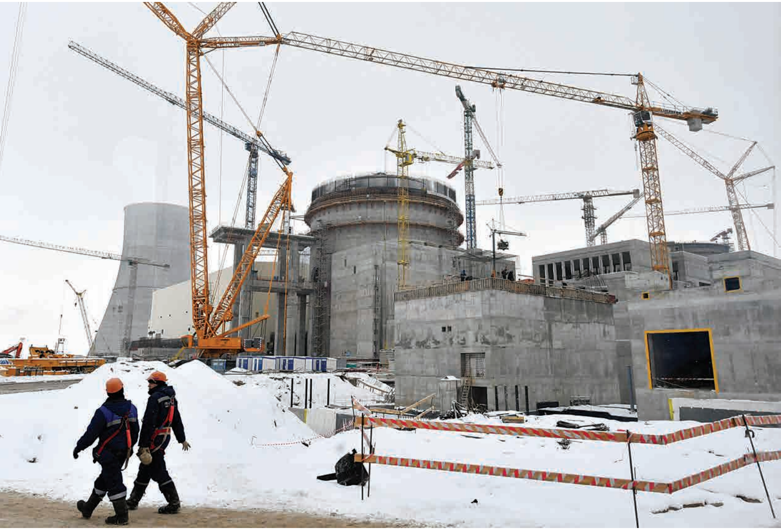
Astravets Nuclear Power Plant.