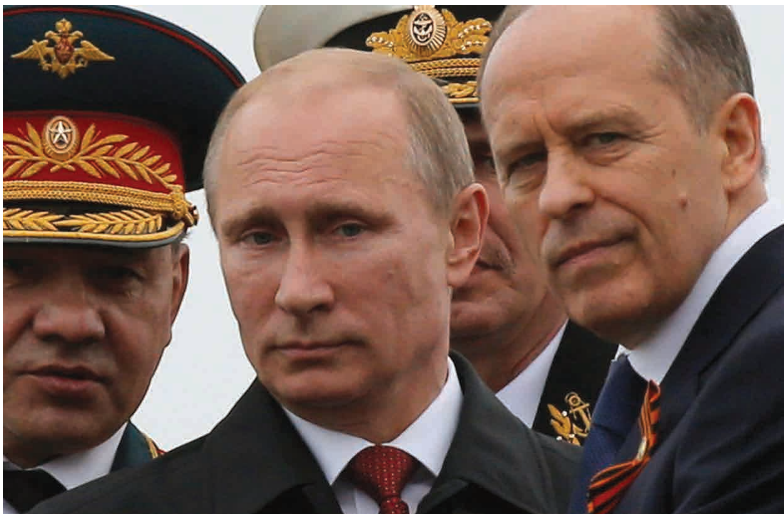
Russian Minister of defence, President and Director of FSB.